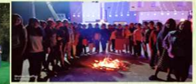
III & IV EEE at ARAKU trip