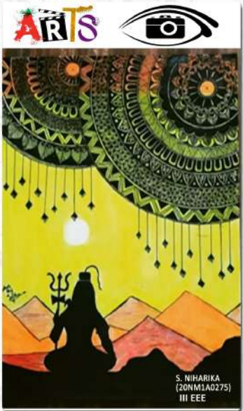
S. NIHARIKA (20NM1A0275) III EEE