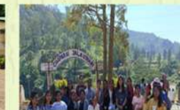
III & IV EEE at ARAKU trip