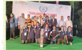
VIGNANOTSAV 2K22, 4th-5th NOV, 2022, GUNTUR