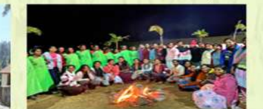
III & IV EEE at ARAKU trip