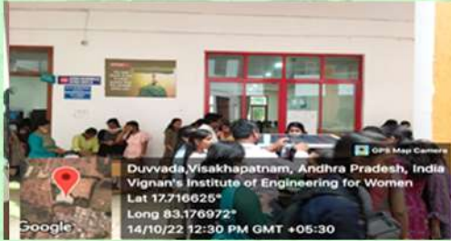
Live Project Exhibition