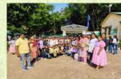
III & IV EEE at ARAKU trip